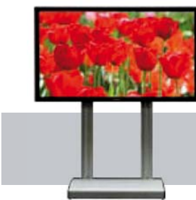
Presentation in landscape position