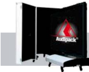
Removing the FP Liftomatic from the flightcase