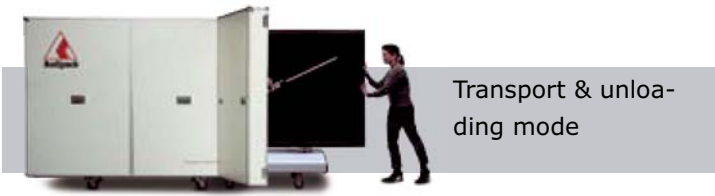
Transport & unloading mode