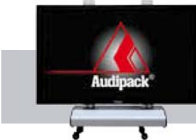
Ready for indoor transport with internal wheel system