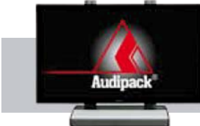
Retracted wheels, ready for presentation or lifting