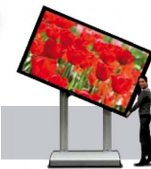
Pivoting the flatpanel