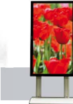
Presentation in portrait position